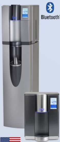
ION 200 – tri-temp water ION 400 – sparkline + water