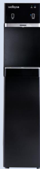
W7+ – UV + hot + cold