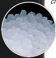
chewable style ice