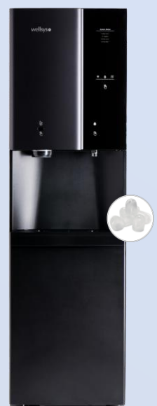
W12i+ – ice + water ("bullet" style ice)