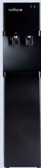
W5 – hot + cold